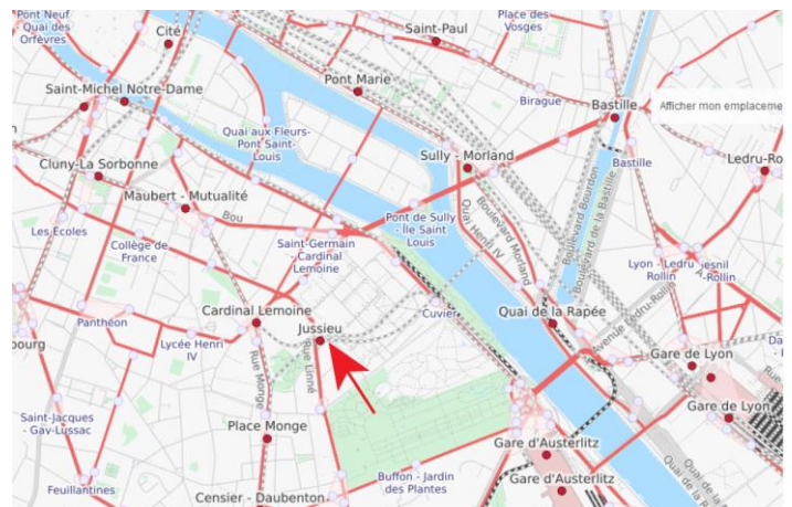
Sorbonne Université, 4 place Jussieu

quentinborderie@yahoo.fr aline.garnier@u-pec.fr