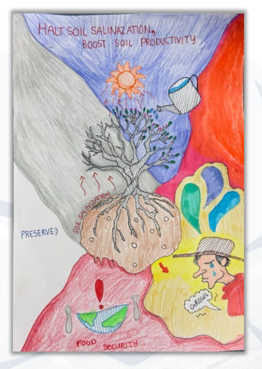
Riti from India, 12 years old